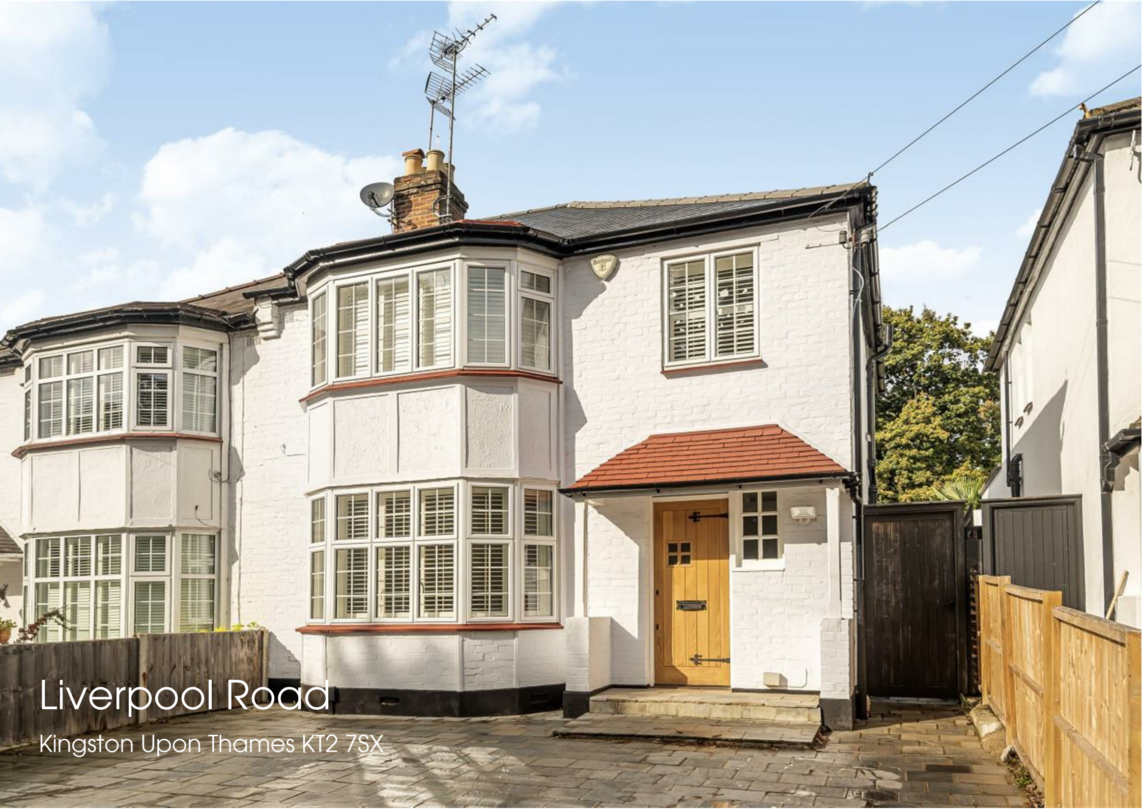
Liverpool Road Kingston Upon Thames KT2 7SX